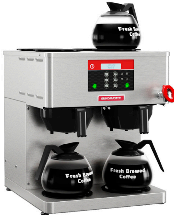
Model B-6 (Decanters sold separately)