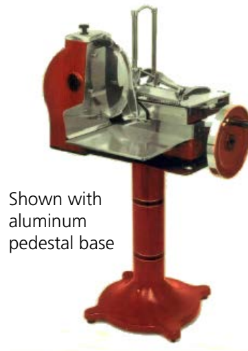
Shown with aluminum pedestal base