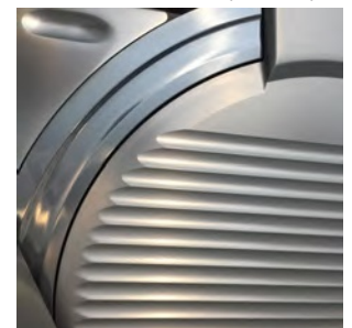
Grooved Vacuum Release Blade (GVRB)