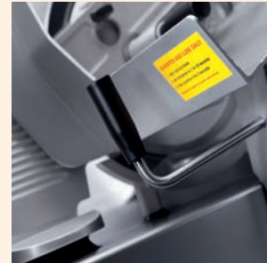
Remote Sharpener, better food safety